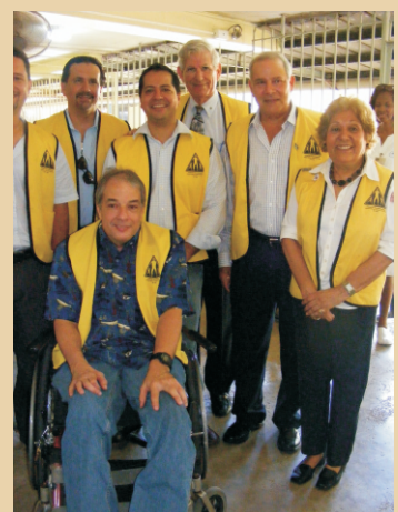
Our wonderful partners in the receiving countries, as Fundación Pro Integración in Panama City, work an average of 40-50 hours per wheelchair to make sure they get to those who need them the most and are serviced when needed.